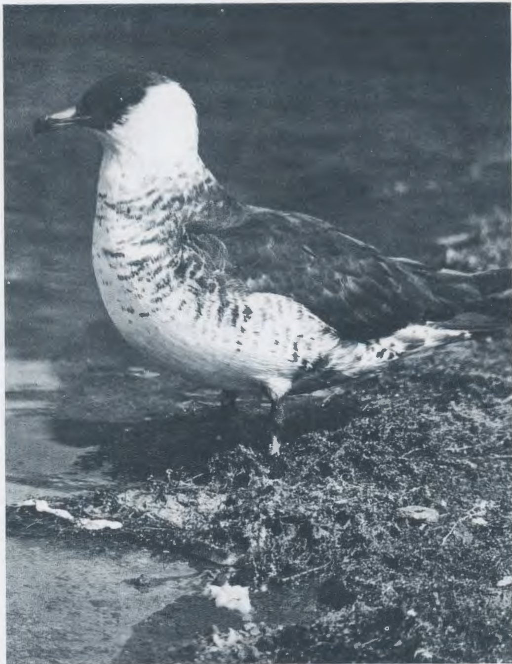
Parasitic Jaeger photographed at Colyer Lake near State College, Pa. on July 15, 1969

common near Pittsburgh, Pa. (DBF) but were completely absent near Morgantown, W. Va. (GAH). Red-headed Woodpeckers may be making a modest comeback. They were seen near East Liverpool, Ohio (NL); they nested near Clarksville, Pa. (RKB); and